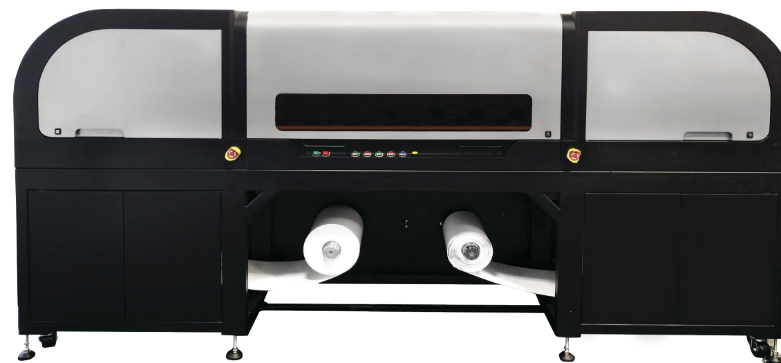
LPS330 Label Press